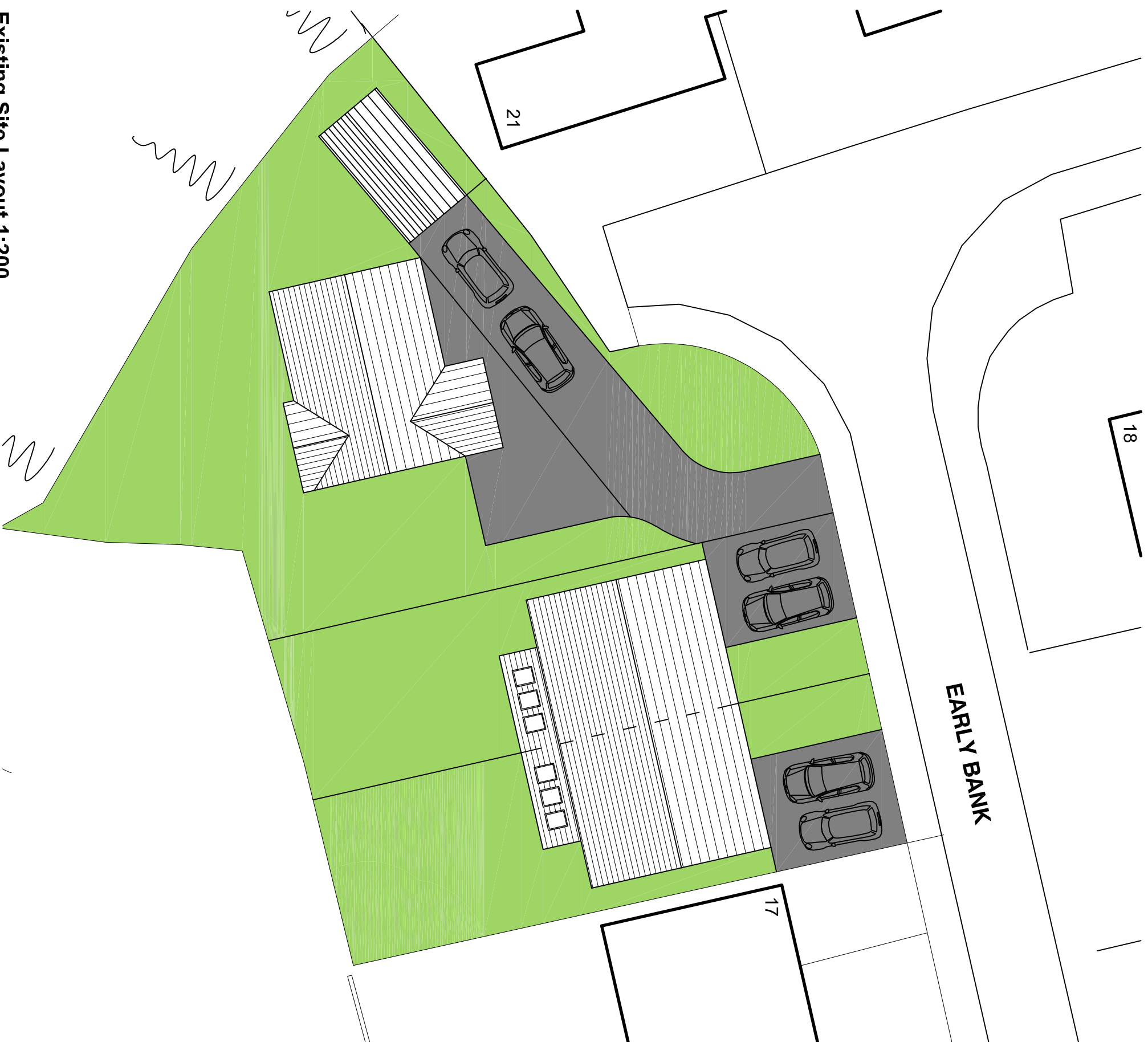
Existing Site Layout 1:200